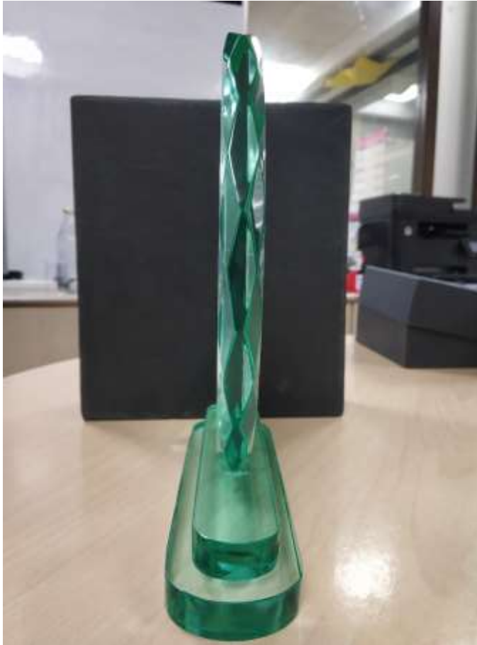
Trophy B and C