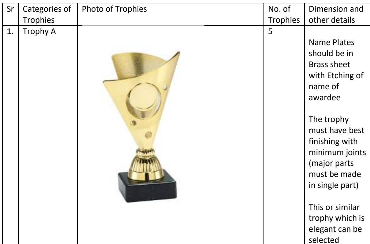
Table 1: Technical Specifications

Manufacturing and supply of unique design of NHSRC's trophies as per the technical specification mentioned in Table : 1 , as below.