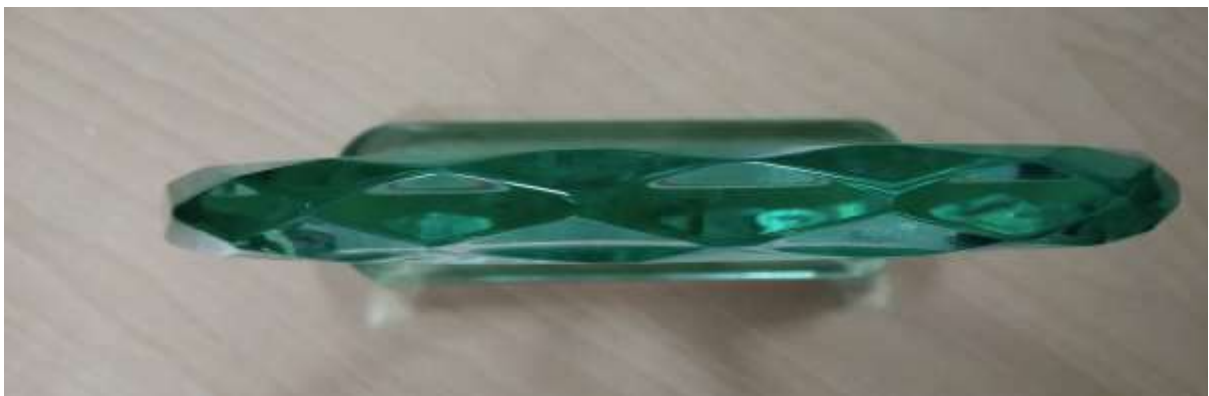
Trophy B and C