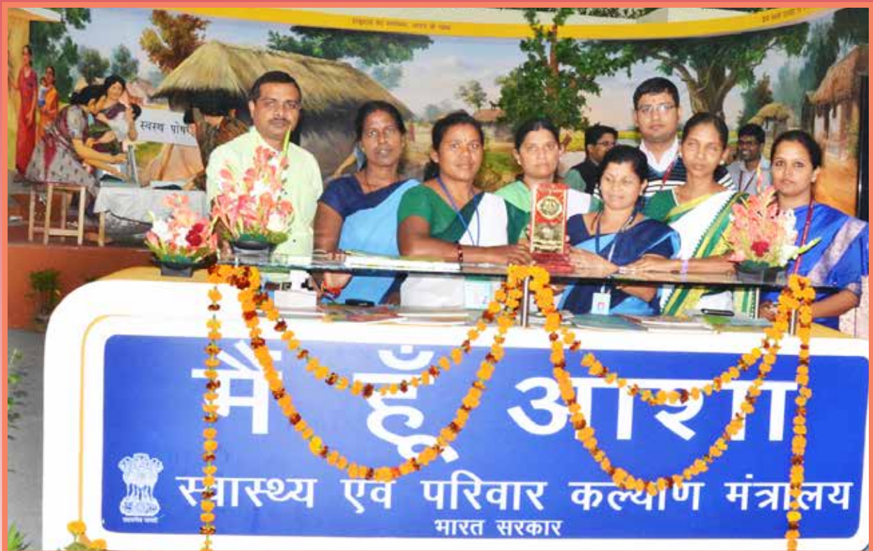
And the Gold Medal for the best pavilion goes to the MoHFW...