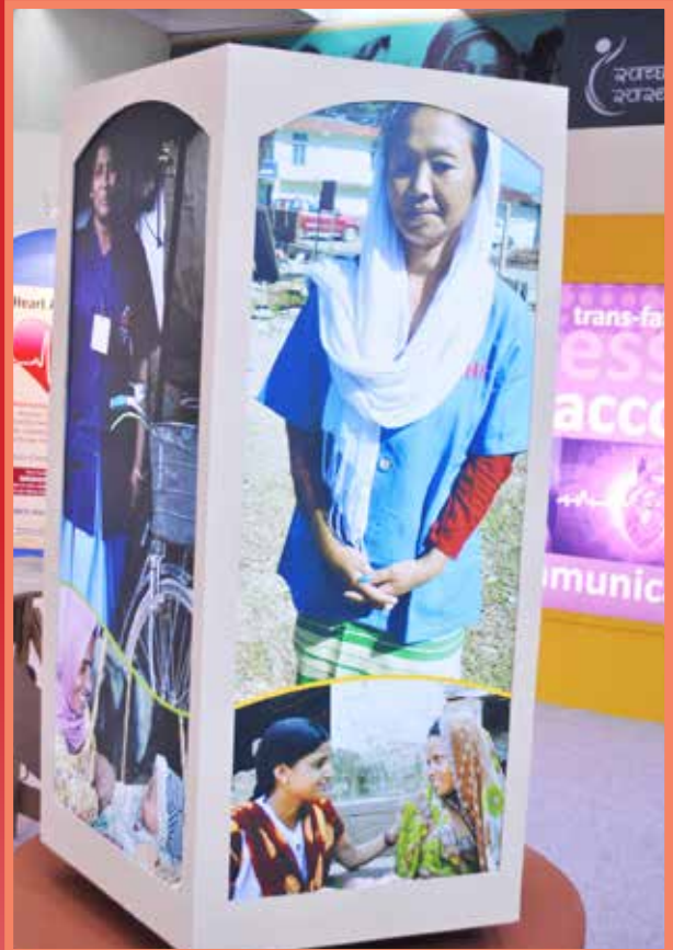
Panels showing ASHAs from various states