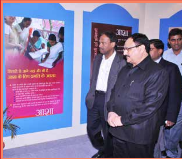
Hon'ble Health Minister visiting the pavilion