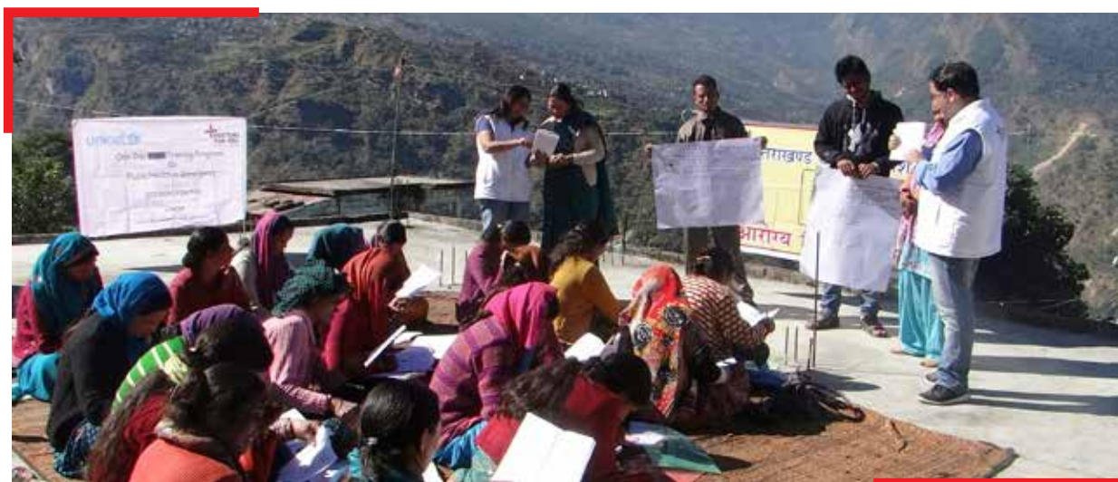
ASHA training on Disaster Management in Uttarakhand

In September 2014, massive floods hit the valley of Jammu & Kashmir, affecting about 10 million. Recognizing the contribution of ASHAs in disaster response, the state of Jammu & Kashmir decided to train and certify ASHAs as first responder and to provide first aid in emergencies to the community till external help arrived. Training of trainers of state trainers was conducted by the resource team of DFY and ASHA training is underway. The state of Assam also started training of ASHAs in Disaster preparedness after the floods hit 16 districts of Assam affecting 12 lakh people in 2014. Since most of the North Eastern states are hilly states and are prone to land slides or floods, other NE states have also planned to begin this training for ASHAs.