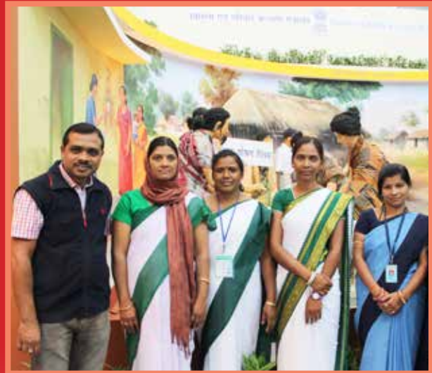
ASHA Facilitators and DCMs from Jharkhand and Odisha