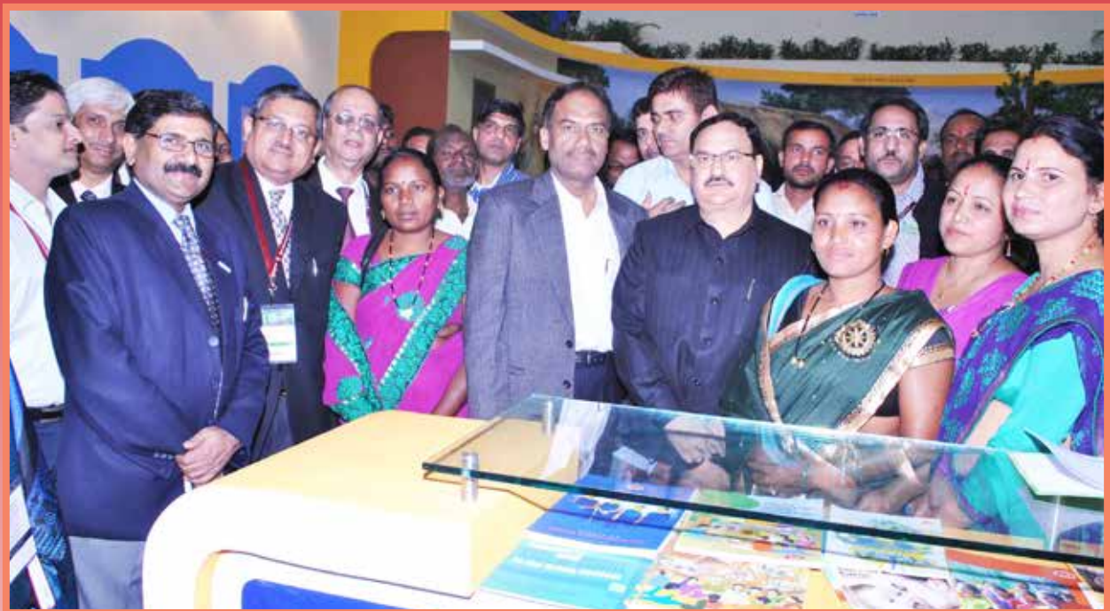
ASHAs Facilitators from Uttarakhand and Chhattisgarh with Hon'ble Health Minister at the inauguration