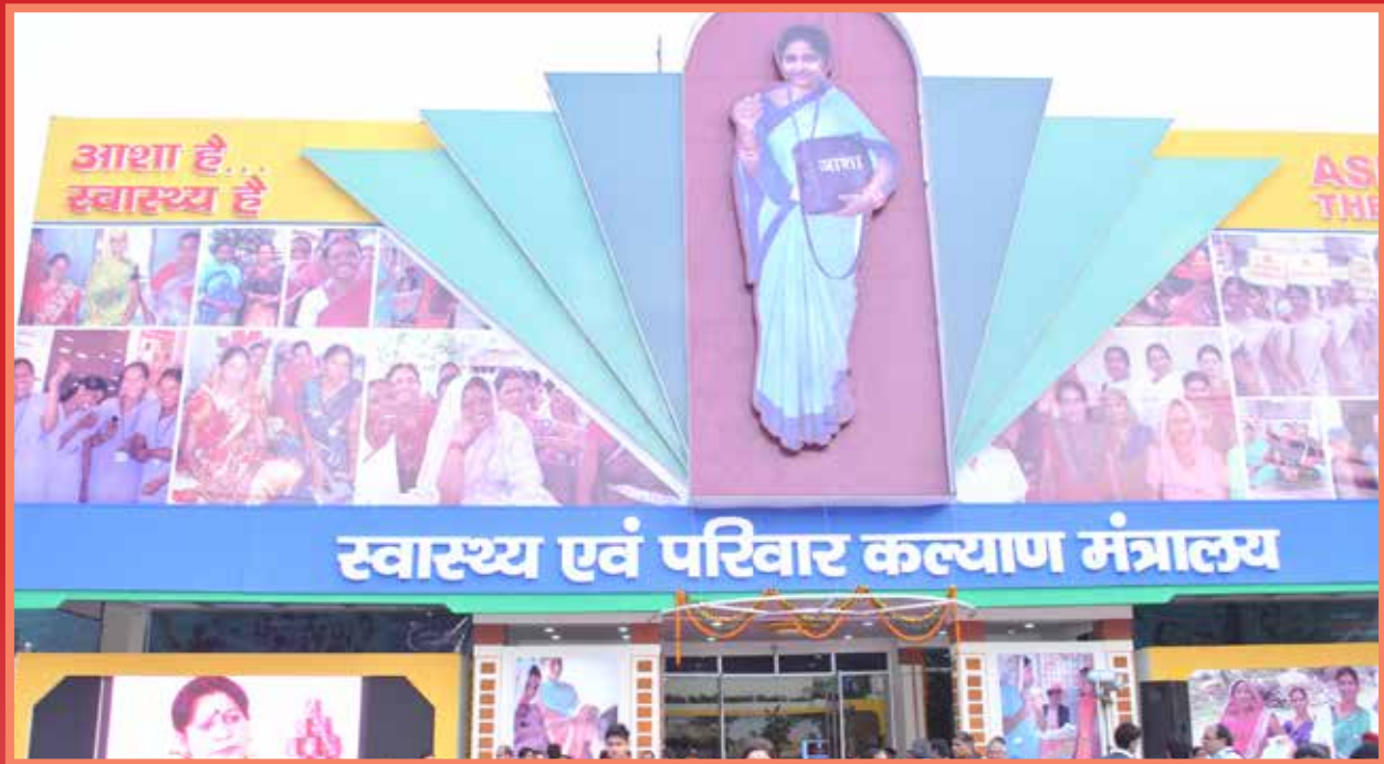
Entrance of the MoHFW pavilion at IITF