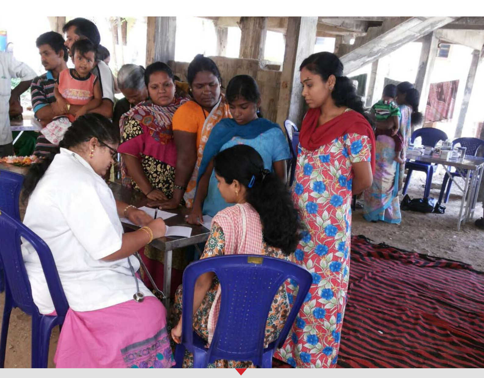
Outreach Camp in Karnataka

The funding support for IEC includes the cost of mobilization and publicity to generate widespread awareness by ASHA, AWW, and MAS members on the objectives of the camp and services available