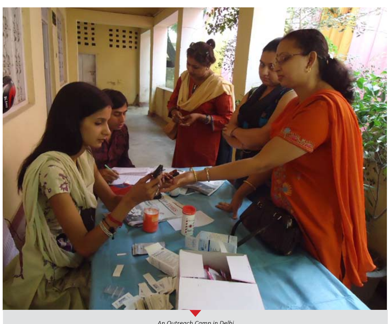
An Outreach Camp in Delhi

12. Involving Urban Local Bodies: Such Special Outreach Sessions should seek active participation of the ULB that ensures ownership and accountability. Such engagement could include provision of monetary resources, space, mobility support, access to non-health facilities, and linkages with other departments such as housing, etc.