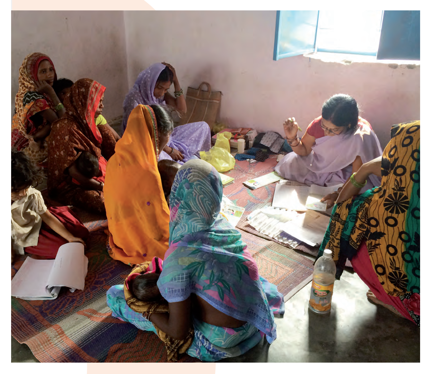
Mandate and Methodology of the 8<sup>th</sup> Common Review Mission